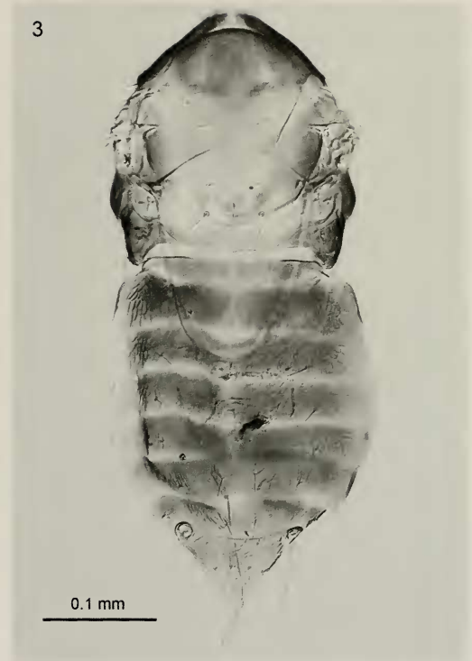
Fig. 3. Encarsia alemansoori n. sp., dorsal meso- and metasoma.

Female. —Morphology as for male, except for antennal (Fig. 11) and genitalia characters (Fig. 12). Antennal formula 1,1,3,3. F1 and F2 subequal and short, without sensilla. F3 and F4 with 2, F5 and F6 with 3,